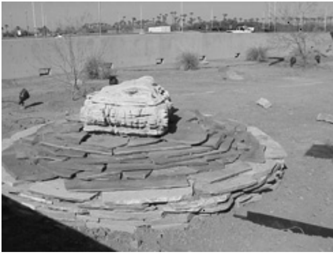
Figure 3. Construction of the butte in GeoScape. The mesa is constructed similarly.

to the students to consequently change the fault from dip-slip to strike-slip. If we choose to make the fault dip-slip, we can further change the dip direction that we give to students to alter the hanging wall designation and thus, the type of fault.